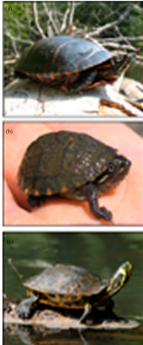
Fig. 1: Photos of turtle species examined in this study. (a) painted turtle ( Chrysemys picta ), (b) juvenile musk turtle ( Sternotherus odoratus ) and (c) yellow-bellied slider ( Trachemys scripta ).

parasites were counted, following descriptions given in Telford (2009). At this magnification, fields of view had an average of 80 ( \pm 13 SD) erythrocytes (Davis, unpubl. data ), so this was equivalent to examining ~8000 cells per turtle. With this value, the number of cells affected by Haemogregarine gametocytes was transformed into a percentage (of erythrocytes) for comparison with other published reports.